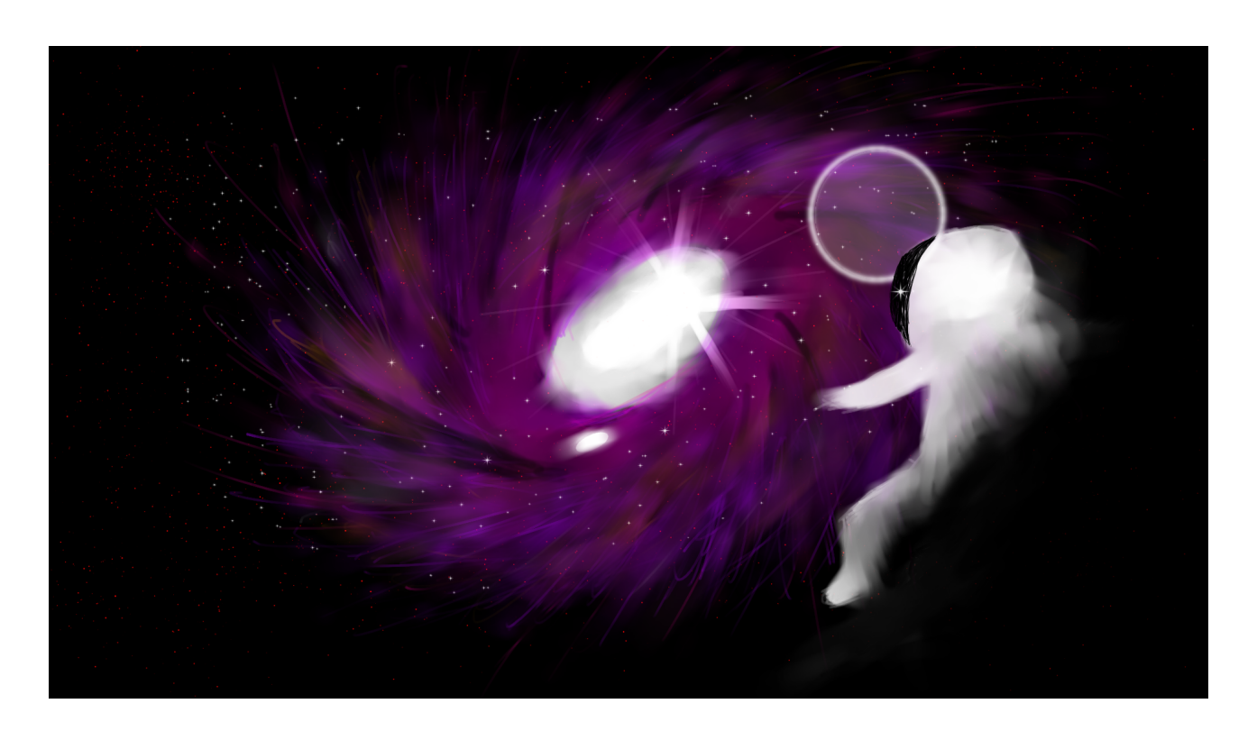
Spacewalk — by Karrot