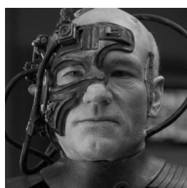
The Collective - items will be assimilated