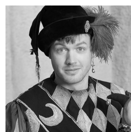
The Jesters - a hunt, but with jazz hands!

These items can be submitted to the Front Desk for Fun Points (after 11am). Pictures are not (generally) admissible; objective involving people must only be undertaken with the other person's permission. The front desk reserves the right to keep the submitted items. Each faction may claim an item on the only once, unless otherwise noted.