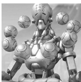
The Omnic - be one with the universe