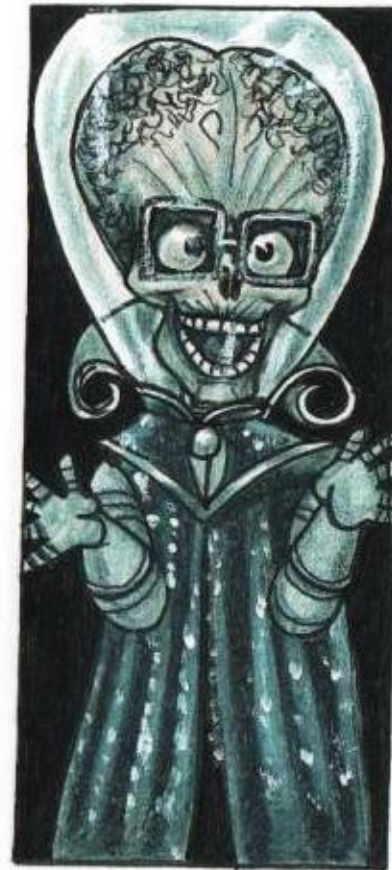
4. AAK AAKAAK