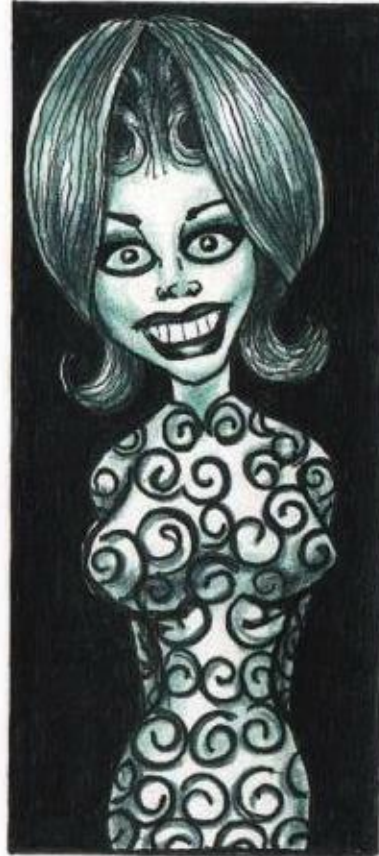
2. AAK AAK