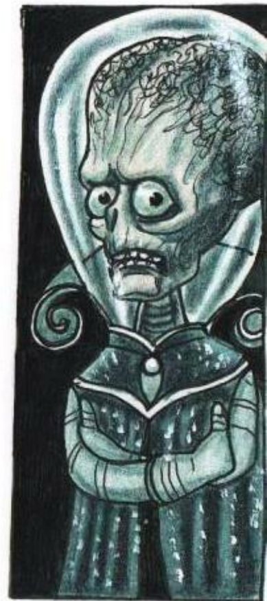
5. AAK! AAK