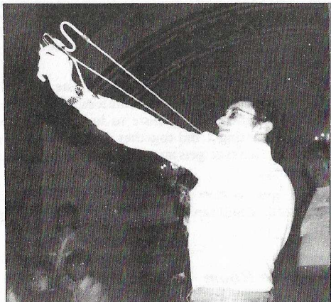
A pork pie on the wing (almost)....

And this is where you come in. I want feedback. As I say, the Albacon II Fan Room will be largely based on the Channelcon one, and I'm interested in your ideas about what I did right or wrong there. Which items and ideas should be repeated