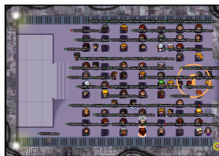
This will never get old