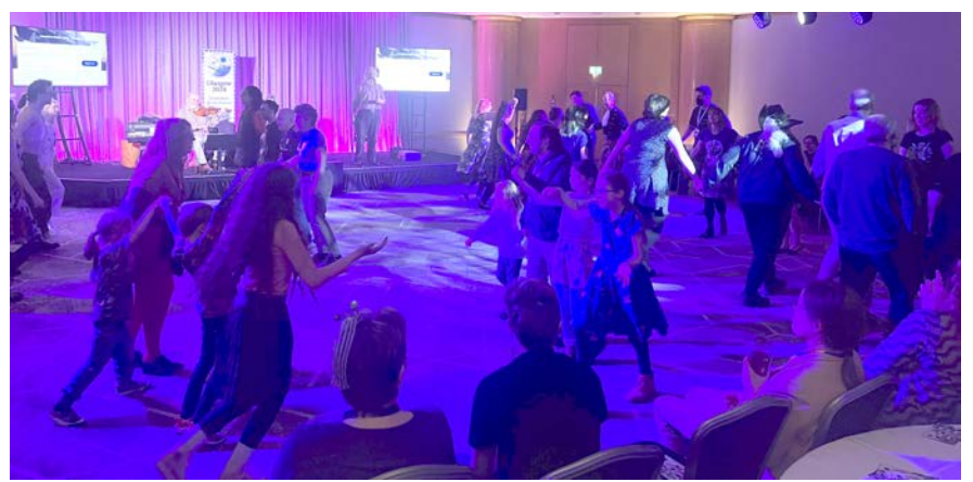
The Glasgow 2024 ceilidh

Do you still need a few more hours of volunteering to qualify for your reward t-shirt of tote bag? Head over to the ops hub to help out.