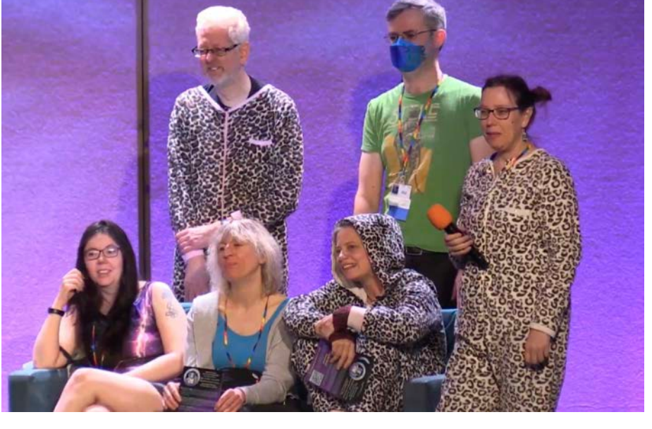
The Catastrophe team [– they were robbed. Ed].

Pick up questions from the ops hub. Hunt till the ops hub closes or runs out of eggs.