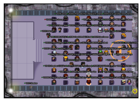
This will never get old