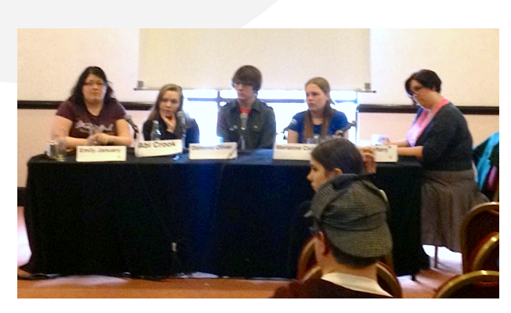
"The problem with fandom is that it's full of old men."