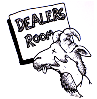
No, Sue, the dealers are accepting groats...

The Dealers' Room would like you to know that Groats are acceptable currency for all debts, public and private.