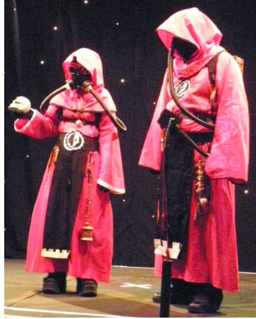
Brotherhood of Mars Eggbrite and Beth