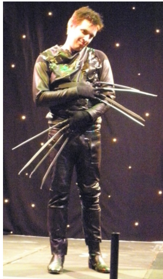
Edward Scissorhands Lucky Kaa