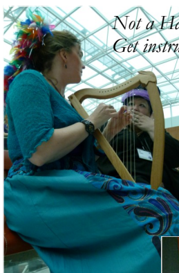
Not a Harpy? Get instruction