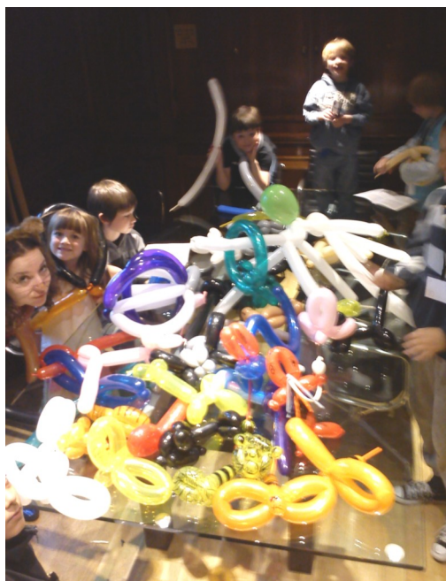
Balloon modelling for children

Would the gentleman who bought the signed leatherbound, slip-cased edition of The Art of George R. R. Martin's A Song of Ice and Fire on Sunday afternoon in the Dealers' Room, please call at the table where he purchased it from.