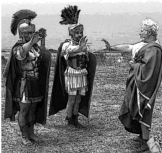
Local Chester officials and Contemplation committee member greet each other

The hotel is right in the heart of Chester, and while the city is not quite as Hollyoaks had led me to expect, it is a fun place to visit. Throw a stick from the hotel and you will likely hit an interesting shop, restaurant or café. A trip on Saturday evening to a nearby Oriental restaurant had us eating more excellent Chinese food than I'd have thought possible without adding stomach extensions, and for a total price that I usually associate with hors d'oeuvre . The hotel itself has stylish décor in both the bedrooms and function space, and proved very comfortable during the visit. See the Contemplation web site http://contemplation.conventions.org.uk and the hotels own site http://www.ichotelsgroup.com/h/d/