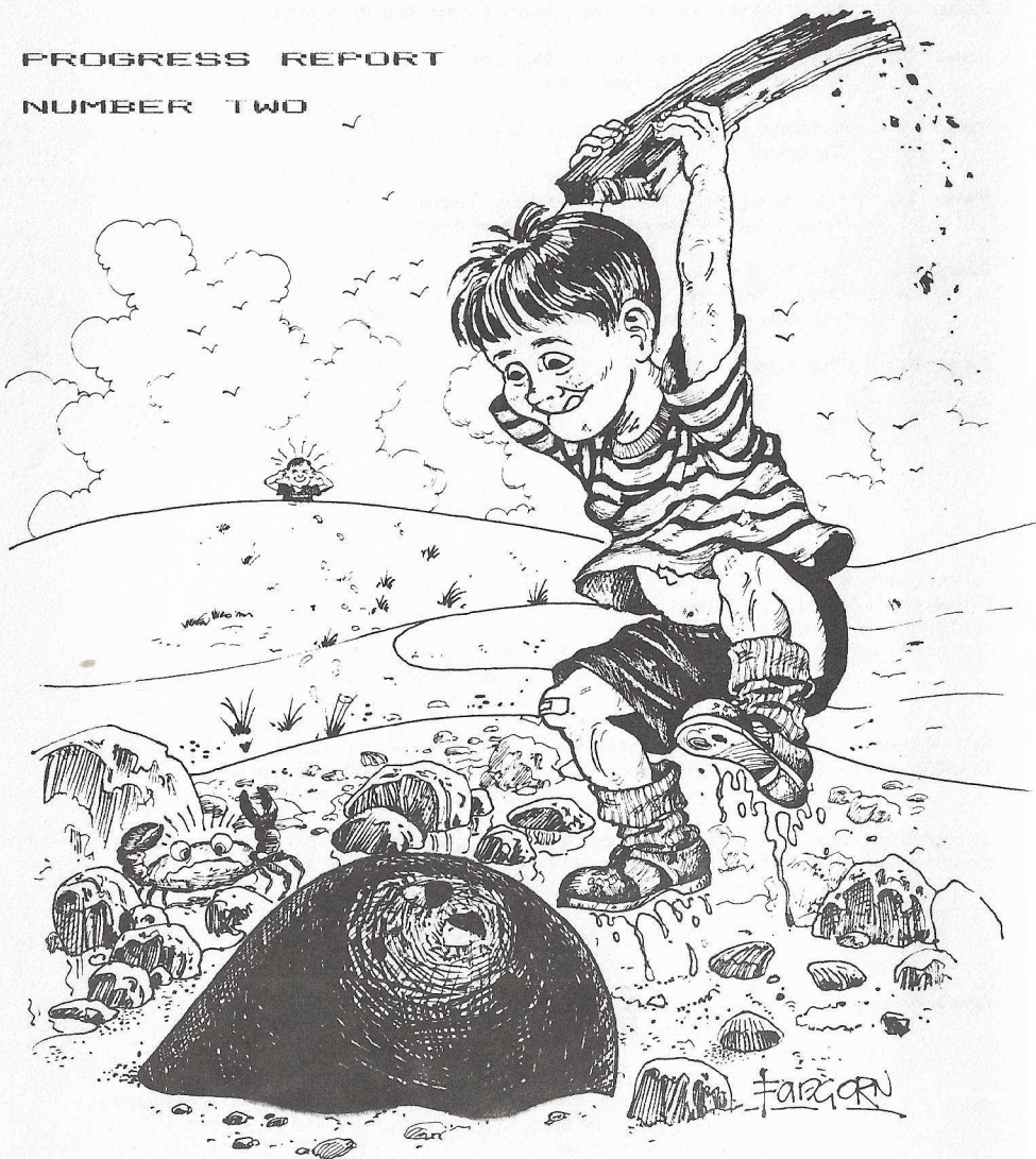
A SCENE FROM "THE WASP FACTORY"