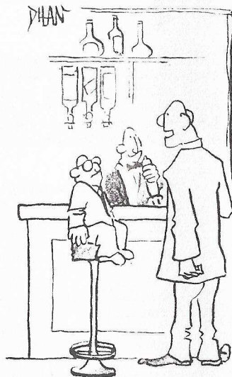
"HE WANTS A SHORT"

The main reason for including this small section on food and drink was to enable me to print the cartoon on the right, I couldn't resist it, and I have been assured it's not about me!!