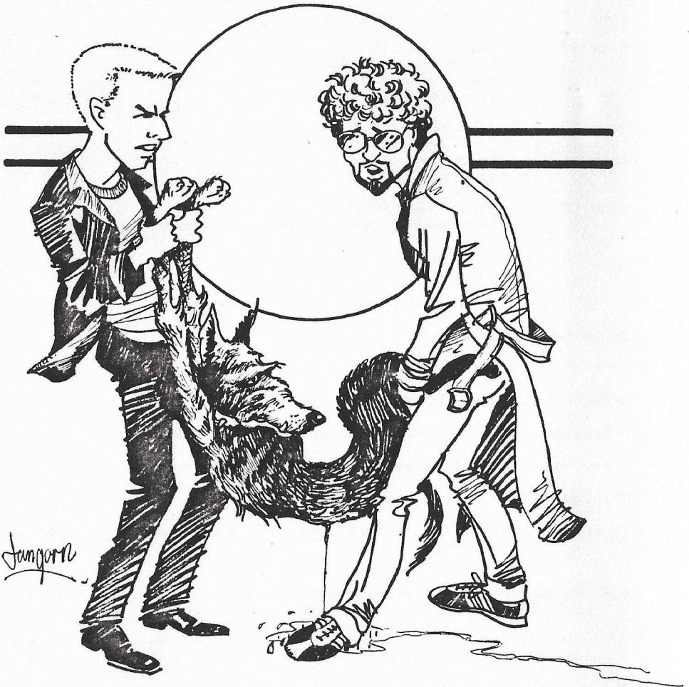
A SCENE FROM "ESPEDAIR STREET"