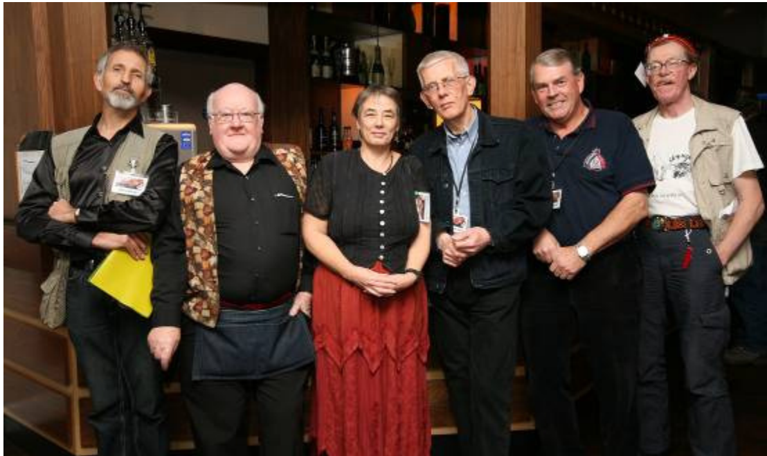
The Magnificent Six