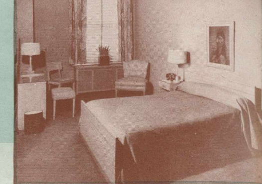
Bed Rooms—spaced for comfort plus convenience. Our guests appreciate the luxurious simplicity and quality of their furnishings

INCE 1873 the Hotel Morrison has been notable among the better metropolitan hotels the country over for the COMPLETENESS of its facilities.