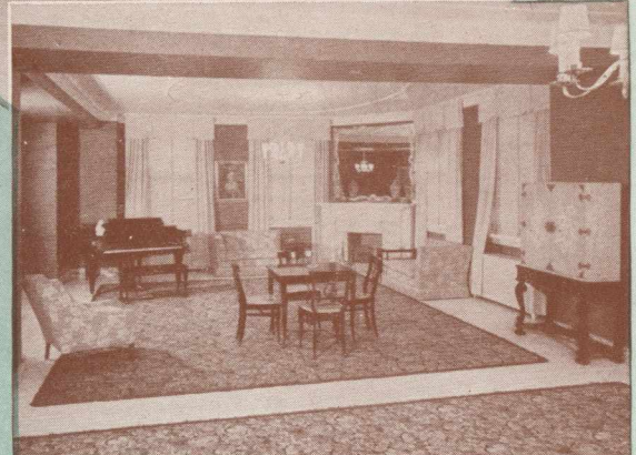
Our luxurious suites are much in demand for meetings and private functions