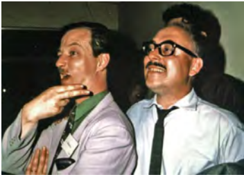
John Brunner, Harry Harrison