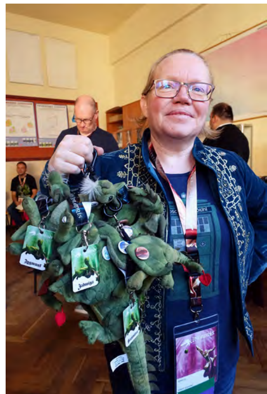
Dragon Plushies at Polcon