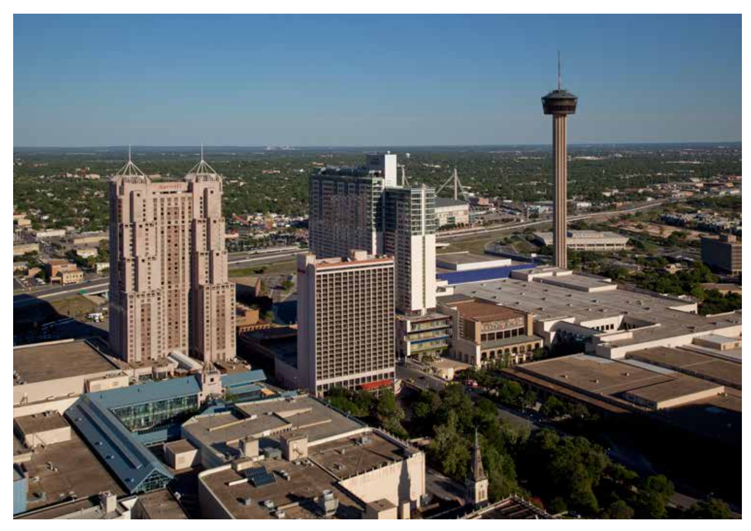
Marriott Rivercenter (Top Left), Rivercenter shopping mall (Bottom Left in Blue), the River Walk Marriott (Medium Height Brown Building, Right of the Rivercenter Marriott), and the Convention Center (Low Building to the Right of the River Walk Marriott).

rooms. If you're interested in booking a suite, then please read the later article on booking suites; this will give you more information on the types available.