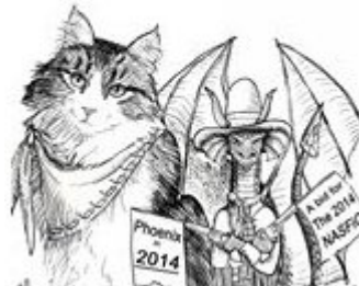
Phoenix in 2014