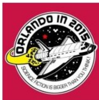
Orlando in 2015