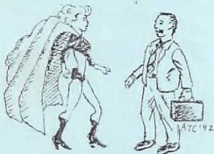
FIRST CON, HVH?

Thursday's winner: #3612 Friday's winner: #1248