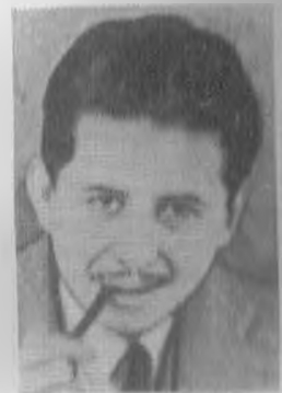
Frank Belknap Long, Jr.