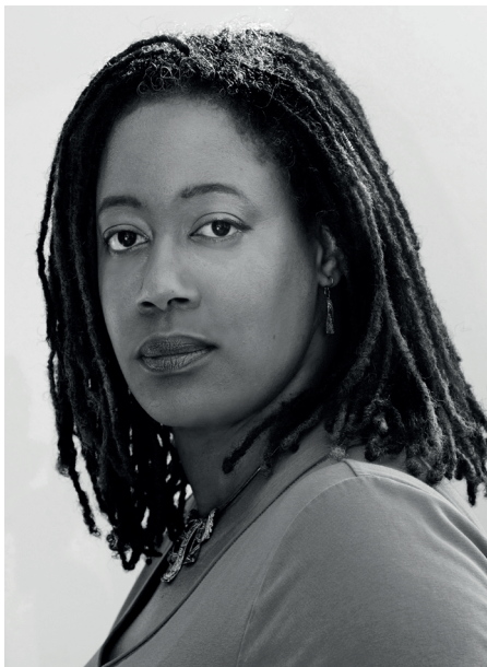
Image: N.K. Jemisin

Best Novel came to many fans as a surprise after his breakthrough in the 2015 Hugos for The Three Body Problem , some authors of the Chinese global diaspora, such as Ted Chiang and Marjorie Liu, won in their nominated categories.