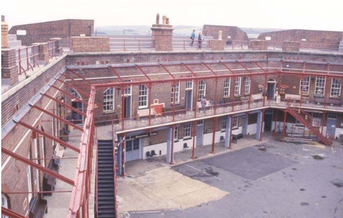
Golden Hill Fort 1991