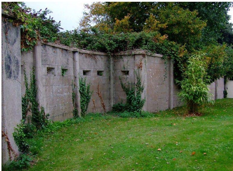
The ferro-concrete wall