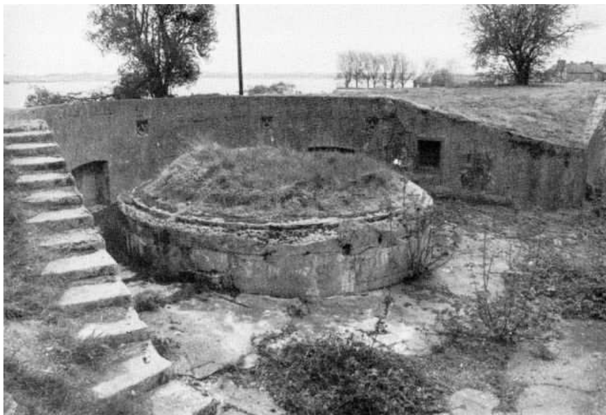
(Peter Kent) 10-inch RML Emplacement