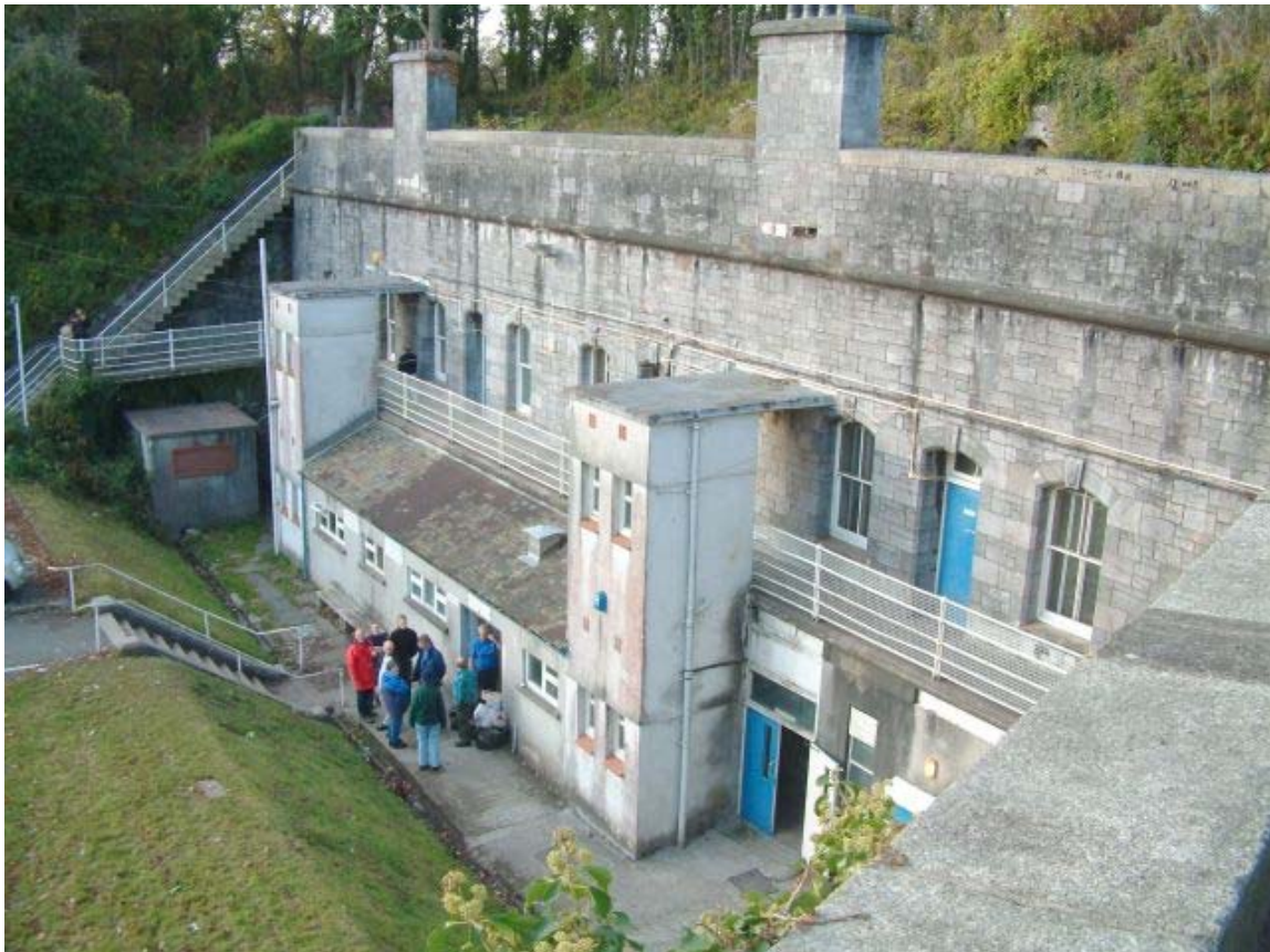
Barrack Block Woodlands Fort