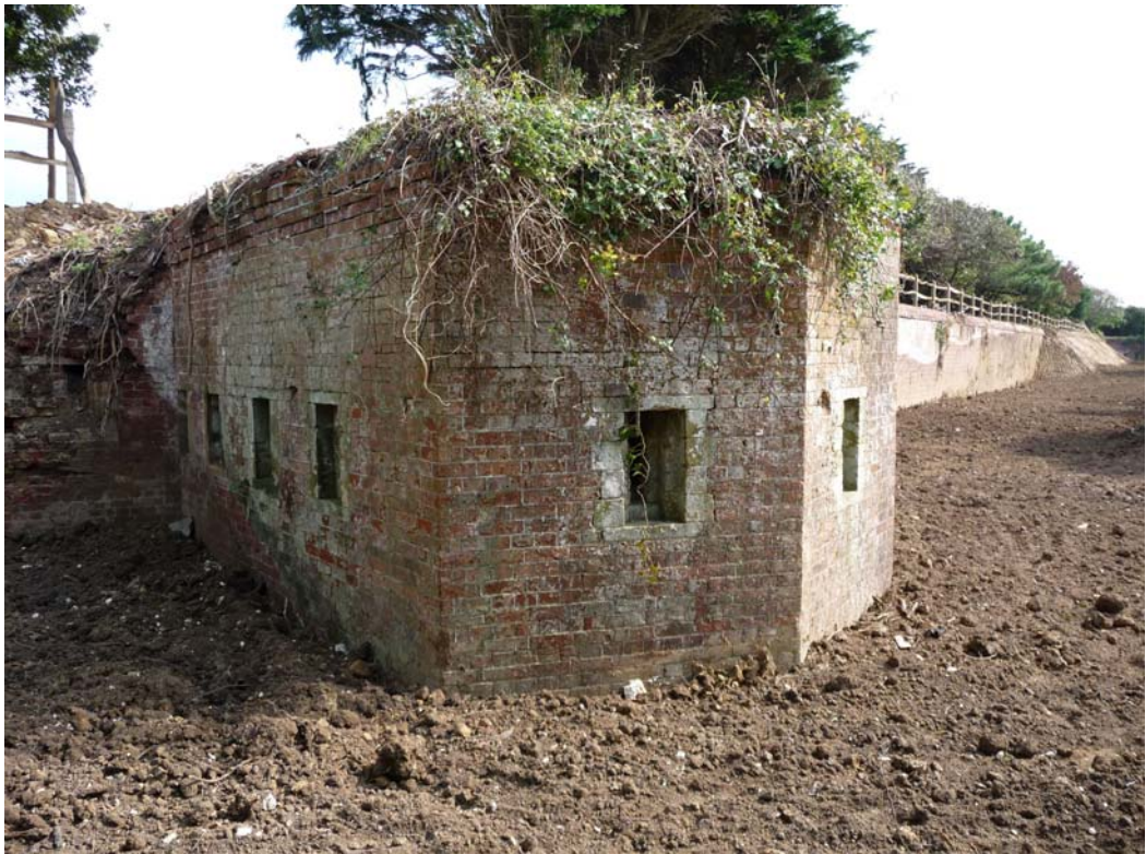
A caponier and section of the Carnot wall in September 2008