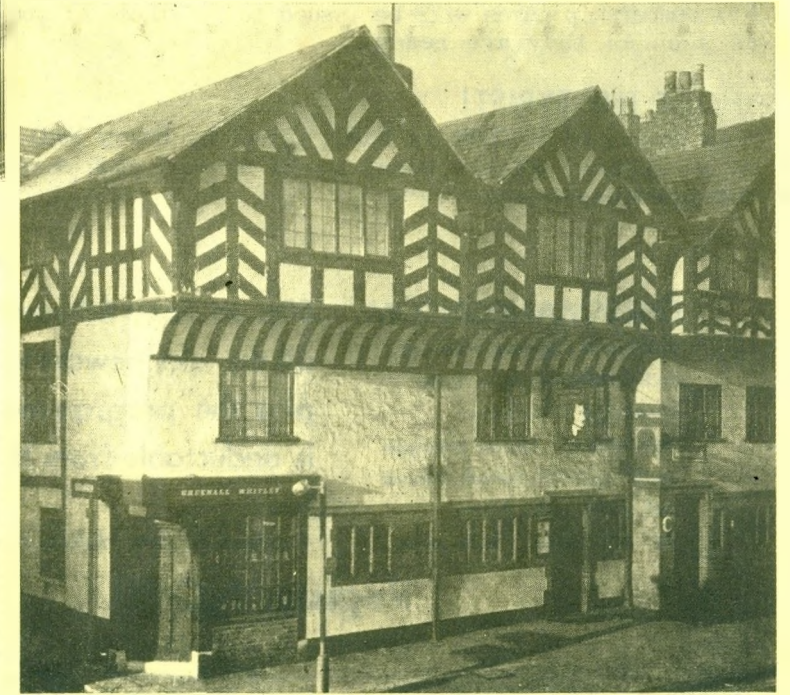
The Old King's Head in Lower Bridge St.