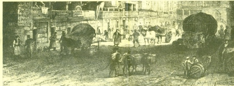
BRIDGE STREET, c.1830 From a drawing by G. Pickering