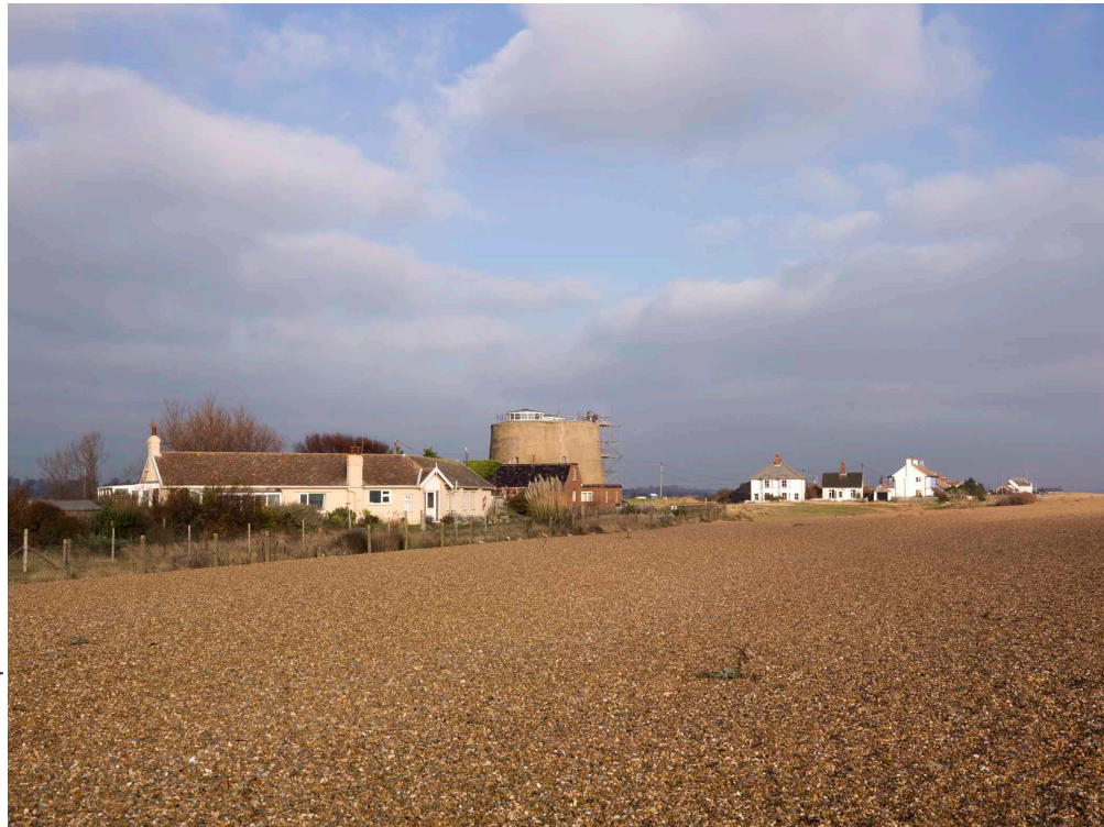
Figure 5: A Photograph of Tower AA with converted Battery in foreground, Shinglestreet, Suffolk (NMR: DP046362)

Tower BB, Shinglestreet, Suffolk , (NGR: TM 3693 4302) was built with a ditch. No remains of this tower were visible. The site of this tower is marked on modern maps by the boundary stones in this area and the presence of Coastguard cottages in this vicinity.