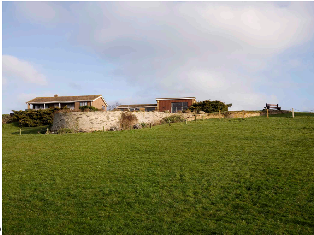
Figure 2: A Photograph of Battery B, Point Clear, Essex (NMR: DP029604)

Tower B, Point Clear, Essex , (NGR: TM 0951 1474) was built with a moat and glacis and supported a forward battery of three guns, it was demolished in 1967 to make way for a housing development. The site of the tower is still visible as a slight earthwork on a patch of open ground adjacent to number 6 Beacon Heights, the forward battery survives, in the garden of number 6, to a height of nearly 1m in places and is preserved to some extent over approximately two thirds of its original length. Some of the coping stones from the tower's parapet and a Board of Ordnance land marker still survive although not in situ. The remains of the battery are now an extremely rare feature. The extent of the original land parcel can still be discerned from modern maps of this area; the Beacon Hill Estate is built entirely within the lands of the tower.