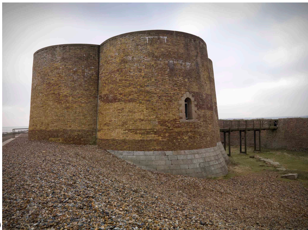
Figure 6: A Photograph of Tower CC, Aldeburgh, Suffolk