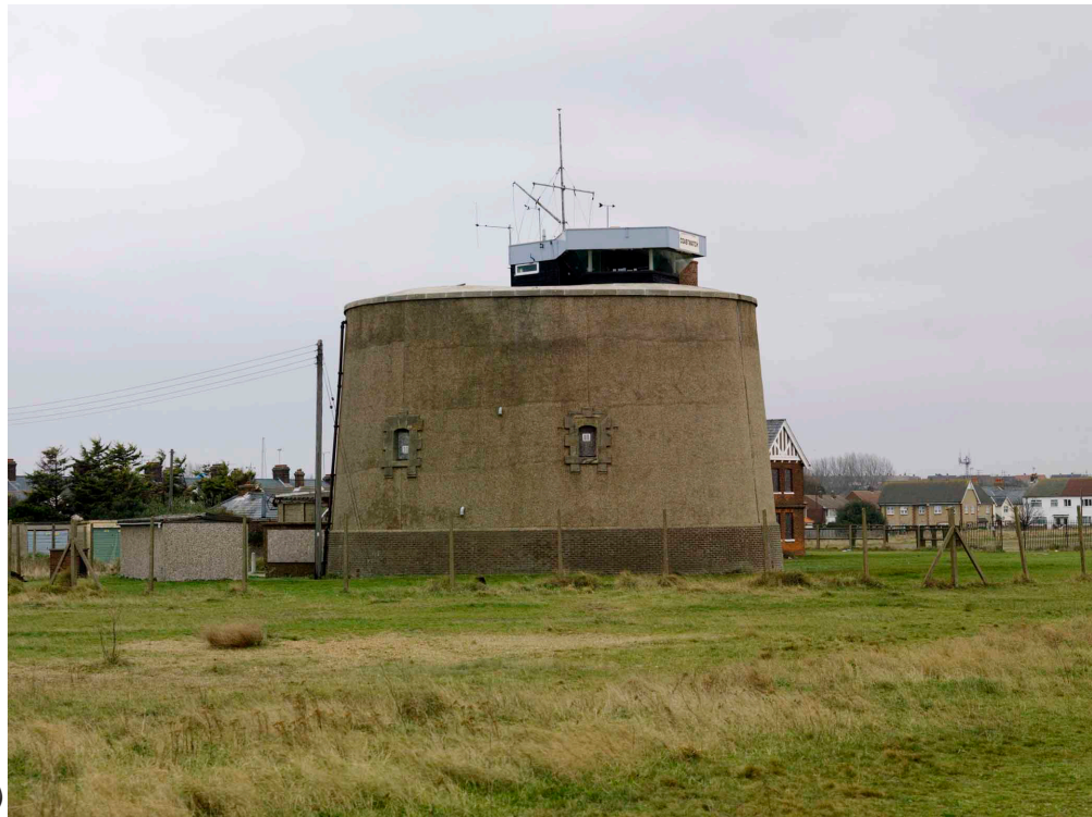
Figure 3: A Photograph of Tower P, Felixstowe, Suffolk (NMR: DP029607)

Tower P, Felixstowe, Suffolk , (NGR:TM 2927 3308, scheduled and grade II listed) was built with a ditch. There is still slight evidence for the ditch around the tower; the observation point adjacent to the tower survives as a subtle platform. The lifeboat house and gun shed shown on the 1860s plan both also survive as platforms, it seems that coastal erosion has not adversely affected this area. The tower has a National Coastwatch observation point on the roof. The tower is pebble dash rendered which looks slightly weathered but the tower is in sound overall condition. The