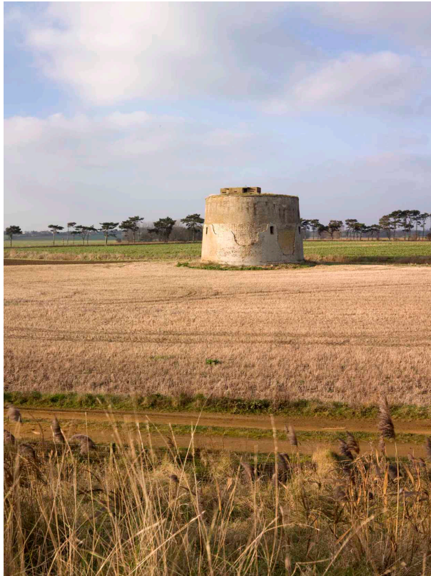
A Photograph of Tower Z, Alderton, Suffolk (NMR: 046358)