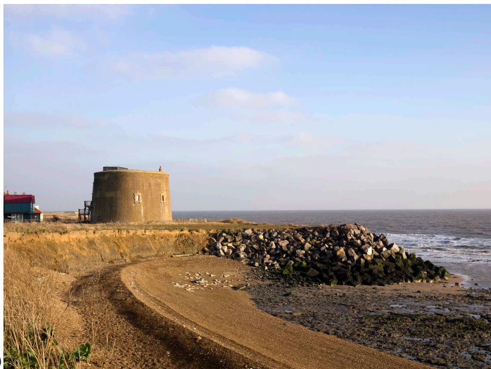
Figure 4: A Photograph of Tower W, Bawdsey, Suffolk (NMR: DP046352)

Tower X, Bawdsey, Suffolk , (NGR: TM 3580 4024) was built with a large ditch surrounding it. There were no traces of this tower surviving; it has been lost due to a combination of coastal erosion, and changing landuse such as the creation of lakes in this area. A coping stone was noted adjacent to this site in 1991 by Robert Carr of Suffolk County Council.